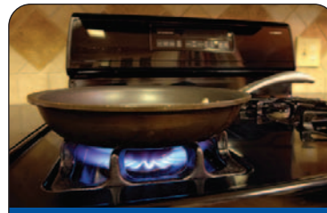
Gas burners give you better temperature control than electric coil burners.

With propane, you'll never have to get up to put another log on the fire, or wait to make sure the fire is extinguished before going to bed. What's more, a propane gas fireplace heats a room evenly and efficiently, and burns much cleaner than wood.