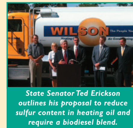
State Senator Ted Erickson outlines his proposal to reduce sulfur content in heating oil and require a biodiesel blend.

The combination of lower levels of sulfur in heating oil and a biofuel blend will reduce carbon from the atmosphere, help lower energy consumption and improve equipment performance. The widespread use of cleaner-burning fuel is also expected to save Pennsylvania oil heat customers millions of dollars.